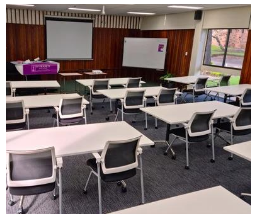
Lecture Room 1