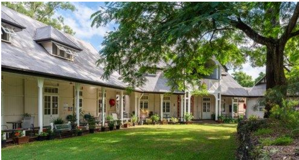
Main Wing has a mixture of short and long-term accommodation options

Rooms are also available for short term hire when you are attending lectures, workshops, or conferences. These basic rooms are equipped with bed, desk, fan, and TV. Kitchen, bathroom, and laundry facilities are shared. Free wi-fi is available. Linen and towels are available on request for an extra fee.